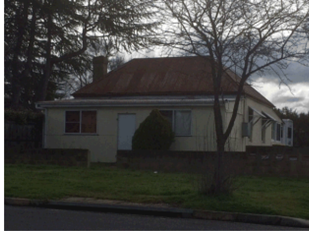
Image of 357 Rankin Street